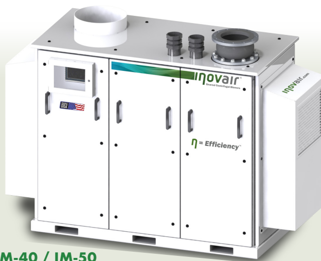
IM-40 / IM-50